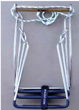
D13 – 3 Steps