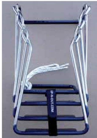
DH3 – 3 Steps