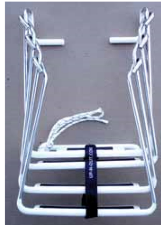
NEW – YW4 – 4 Steps