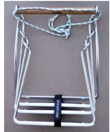
DW3 – 3 Steps