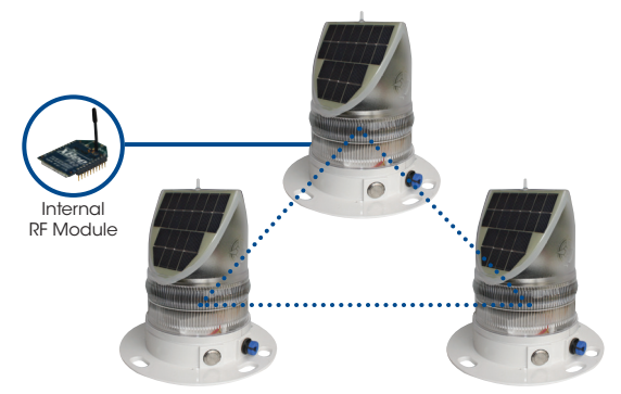
RF Synchronised Class 'C' Lanterns

The SL-CGC60-W-S is a synchronised version of the standard lantern. The installer simply connects the lanterns using a hard-wired connection to maintain synchronised flash patterns as required on multiple lantern installations